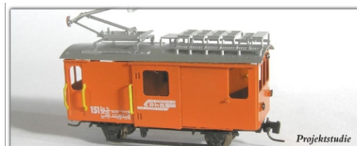
Nm-000.0: RhB Rangiertraktor der Berninabahn De2/2 151