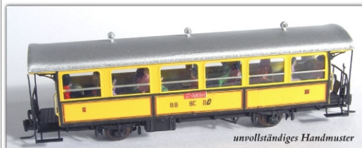
Nm-106.1: RhB historischer Zweiachser der Berninabahn BC110 - aktueller Zustand

This year, we are going to add another vehicle to our historical series of wagons from Rhaetian Railway. In 2011 we will be able to produce the BC 110 as a new construction. This item is built from German Silver, the roof gets it's typical ventilators and electrical sockets, completed with cast parts from brass.