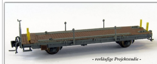
Nm-016.2: RhB Tragwagen für Abrollcontainer Kp-w 7501 ff.

The yellow gudgeons for container-safety will be replaced in the final series by a cast part.