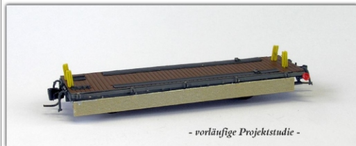
Nm-016.1: RhB Tragwagen für Abrollcontainer mit abgeklappten Seitenwänden, Kp-w 7501 ff.

Last year, we announced some items as a project - just an idea, not really ready at that moment. Meanwhile, the project of the Kp-w 7501 has improved and we think, that it will be finished during this year. We are still puzzling over the correct RhB-container for waste in red, with white lettering. There will be several numbers available, so you can collect a nice little train.