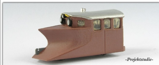
Nm-xxx.x: RhB Dienstfahrzeug Schneepflug X 9103

For the first time, this item will be from plastics, with some extra brass parts for the detailing. Three different variations would be possible: in the former grey livery, in orange or in rusty-red painting. Three numbers could be done, from X 9102 to X 9104. The shown X 9103 is placed in this delivery at Samedan-station at the end of the tracks.