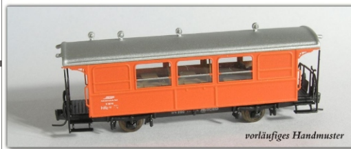
Nm-104.2: RhB Dienstwagen der Berninabahn Rottenwagen für Baudienst X 9079

The first specimen has the wrong ventilators and sockets on the rooftop, which will be correct with the rtr-item.