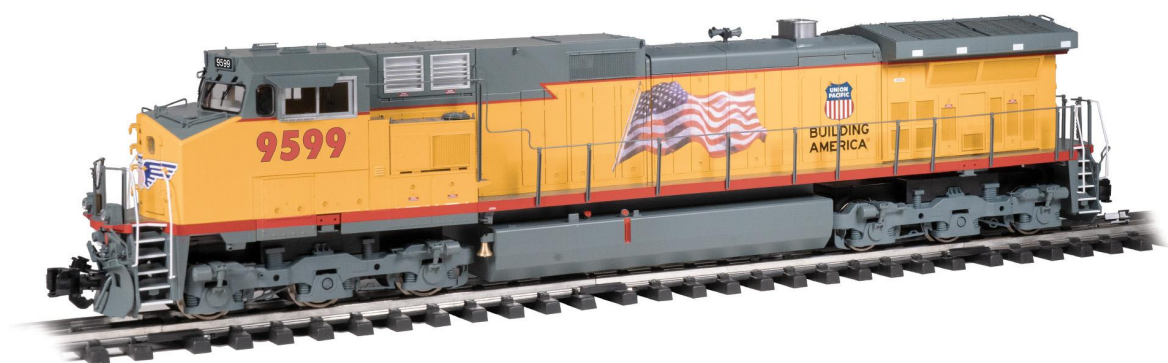
UNION PACIFIC® #9599 Item No. 90904