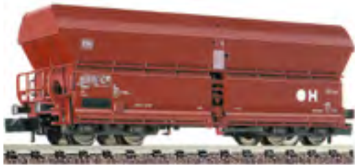
852311, Ep. IV

Every wagon can be purchased individually for € 19,90 at your specialized dealer.