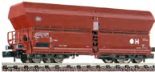
852312, Ep. IV