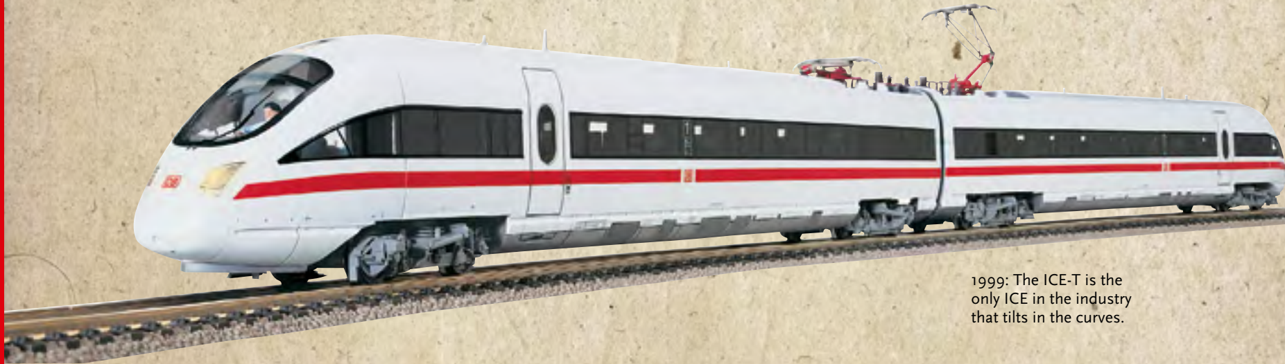
1999: The ICE-T is the only ICE in the industry that tilts in the curves.