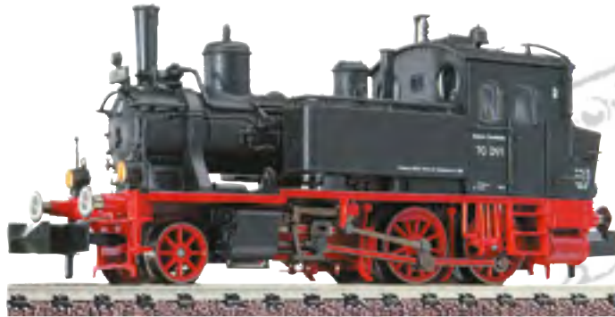
707000 Steam locomotive BR 70.0 of the DB, Epoch III