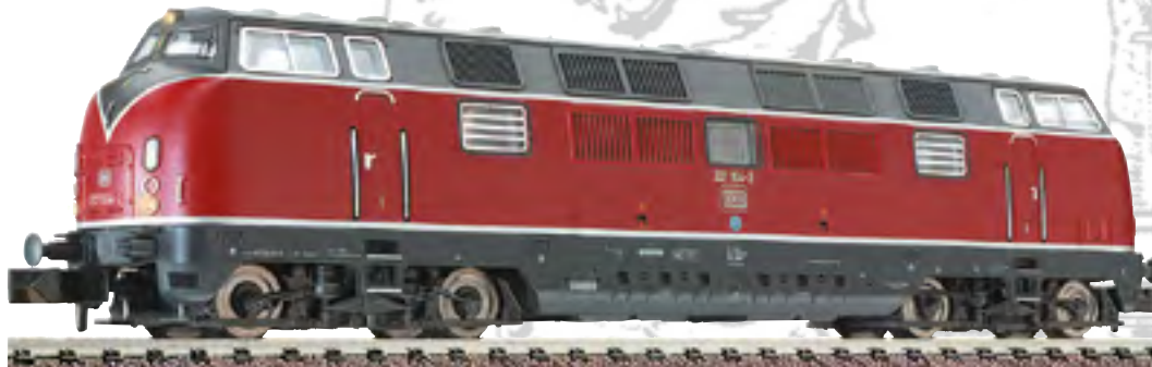
725000 Diesel locomotive BR 221 of the DB, Epoch IV with digital interface