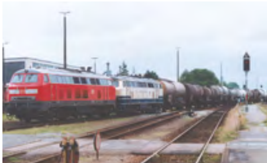
Kesselwagen eignen sich hervorragend für das Zusammenstellen von Ganzzügen.