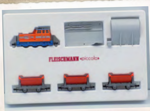
The little lorry train in track N was presented for the first time in 1968/69.