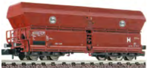
852313, Ep. IV