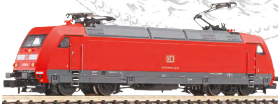
735500 Electric locomotive BR 101 of the DB AG, Epoch IV with digital interface