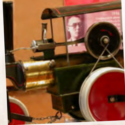
Illustration bottom: The beginning of track o

Illustration right: Stationary locomobile