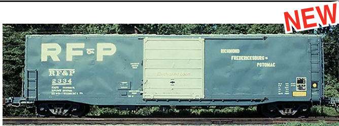
New Paint Scheme

#6925 KDC #025.....$43.95 Sample Artwork of the 2019 KDC Christmas Car.