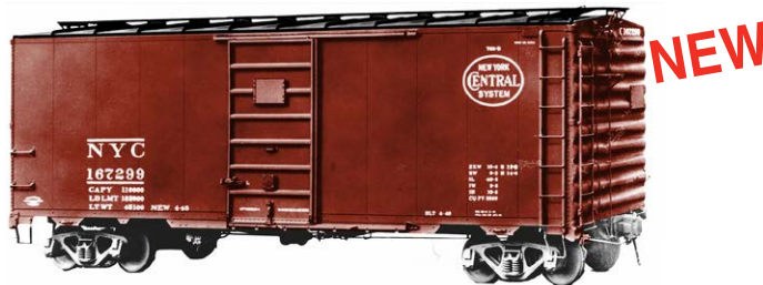
New Paint Scheme

#4329 NYC #167299.....$39.95 40' Boxcar - 6' Door, Built 1948, Factory New, Boxcar Red