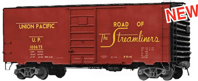
New Paint Scheme

#4326 UP #100675.....$39.95 40' Boxcar - 6' Door, Built 1948, Factory New, Red Oxide, Yellow lettering, Black Ends & Roof