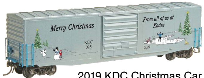
2019 KDC Christmas Car. This is a sample of what the car may look like.

#6925 KDC #025.....$43.95 Sample Artwork of the 2019 KDC Christmas Car.