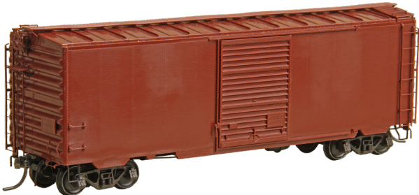
#5200 Undecorated 8' Door Boxcar - Boxcar Red .....$33.95 40' PS-1 Boxcar - post 1954 car, low tacks, welded ends, wide bolster tabs, with roof walk