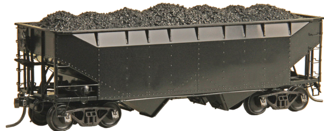
#7501 Undecorated Open Hopper - Black .....$39.95 50 Ton AAR Standard Open Bay Hopper with Enterprise Latches