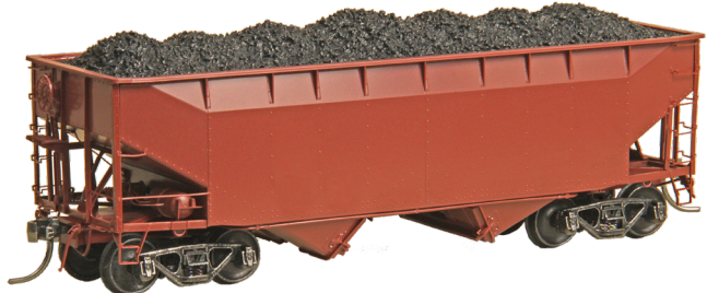
#7002 Undecorated Open Hopper - Boxcar Red .....$39.95 50 Ton AAR Standard Open Bay Hopper with Wine Latches