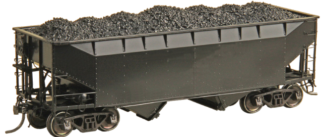
#7001 Undecorated Open Hopper - Black .....$39.95 50 Ton AAR Standard Open Bay Hopper with Wine Latches