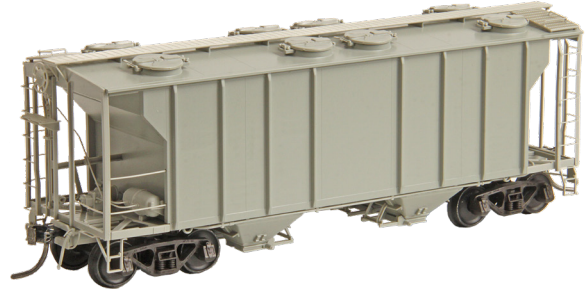
#8001 Undecorated Covered Hopper - Light Gray.....$39.95 PS-2 Two Bay Hopper - hat rub