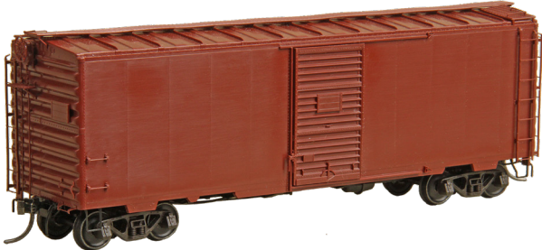
#4000 Undecorated 6' Door Boxcar - Boxcar Red .....$33.95 40' PS-1 Boxcar - 1950-1953 car, high tacks, riveted ends, narrow bolster tabs, with roof walk