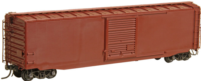
#6000 Undecorated 9' Door Boxcar - Boxcar Red .....$33.95 50' PS-1 Boxcar - sharp slope no lip sill car, low tacks, welded end seam, with roof walk