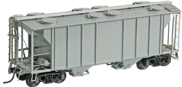
#8601 Undecorated Covered Hopper - Light Gray.....$39.95 PS-2 Two Bay Hopper - channel rub