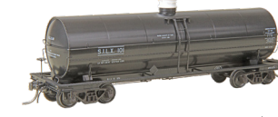
9020 SILX #101.....$45.95