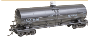
9018 RTCX #4886.....$45.95