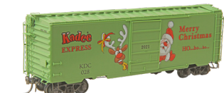
6928 KDC #028.....$42.95