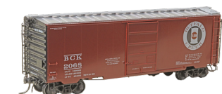
4932 BCK #2068.....$39.95