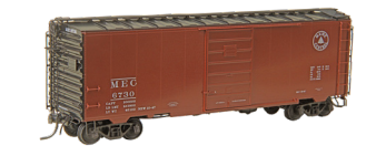
4330 MEC #6730.....$38.95