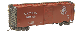
4327 SOU #262050.....$39.95