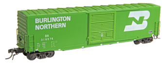
6415 BN #318976.....$39.95