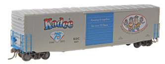
6927 KDC #027.....$42.95