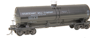
9019 SMCX #111.....$45.95