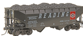
7523 RDG #87255.....$43.95