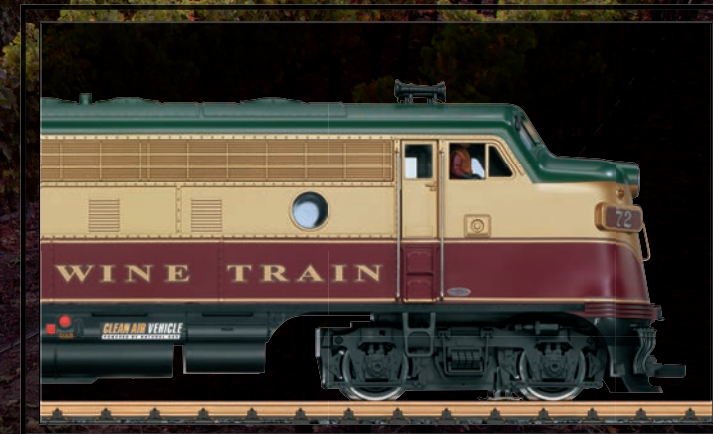
Image of the actual Napa Valley Wine Train.