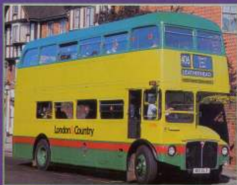
Model No. RM061 Edition: 2,000

Route 406 travelled through Ewell Village, but it wasn't seen for long as in 1996 it was sold on to another company.