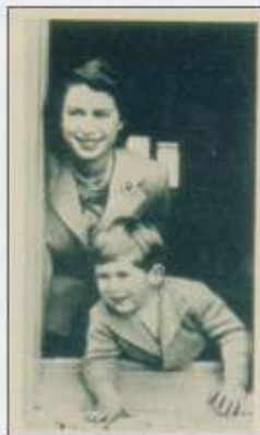
Prince Charles and the Queen looking out of a window at Balmoral Castle.

Our 48th Bullnose in the series - not long until we hit the BIG 50!