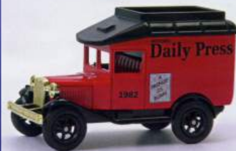
Model No. A030 Edition: 2,500

At the time it would have cost you 3d, but today you could pick it up for £3