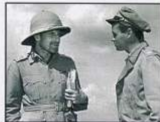
Wingate, clutching his copies of Plato and Aristotle, talking with Colonel Cochran of the U.S. Army Air Force

The First Chindit Expedition - 'Operation Longcloth', was launched in February 1943 and there were heavy casualties, but it proved that British Troops could fight on equal terms with the Japanese in the jungle. The Second Expedition - was 'Operation Thursday' and it was aimed at destroying Japanese communications from southern Burma to the north in Imphal and Kohima. Over the next few months the Chindits destroyed roads, railway bridges and convoys, but suffered heavy losses. Wingate was killed when his plane crashed into a hillside near Imphal during a storm on 24th March 1944.