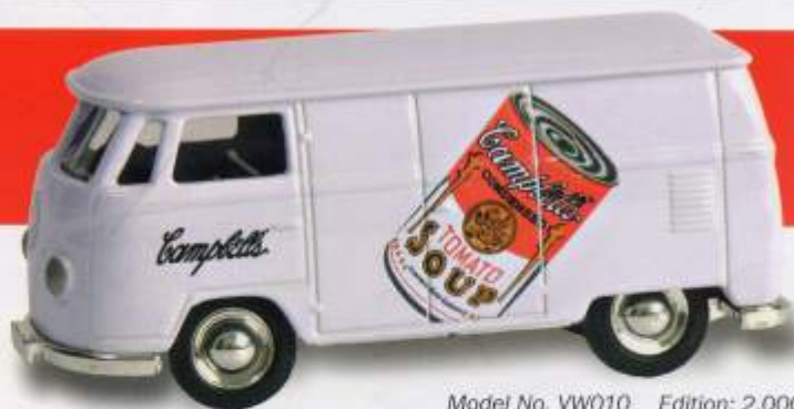
Model No. VW010 Edition: 2,000

Rich, nourishing and substantial. Made from the best that grows in the heart of New Jersey's finest farming district. High grade in every sense of the words. Over SIXTEEN MILLION cans sold in 1904.