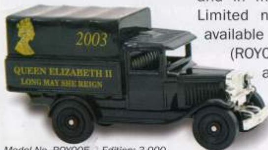
Model No. ROY005 Edition: 3,000