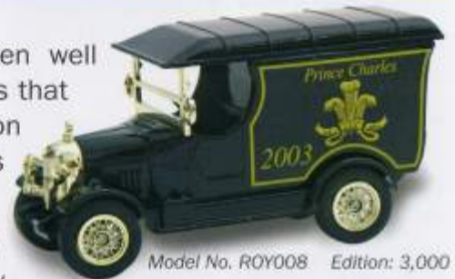
Model No. ROY008 Edition: 3,000

The vehicles have appeared in many regional papers throughout the country and in magazines such as Peoples Friend. Limited numbers of the four shown are available to club members. If you buy all four (ROY005-ROY008) you can have them at a special price of £12.95 whilst stocks last. Orders must be placed by 15th July latest.