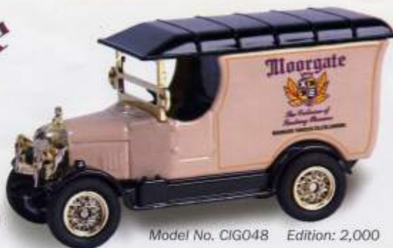
Model No. CIG048 Edition: 2,000

The collector cards supplied with cigarettes were very popular. In 1953 Moorgate supplied a set of 30 cards celebrating the Queens Coronation in a series entitled THE NEW ELIZABETHAN AGE. Twenty of the Cards were Standard Size and 10 were Large Size. The set consisted of varnished photographs of the Coronation itself, and many of The Queen and her family showing the children at a very young age. There was a lot of informative text printed on the backs of the cards. If you've got a full set in good condition then you could expect to get £30-£40 today.