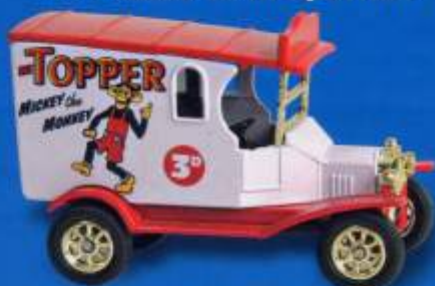
Model No. CC022 Edition: 1,000

Can anyone help us with the name of the parrot?