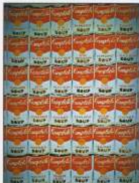
200 Campbell's Soup Cans

In 1898 the company invented condensed soup which was ideal for use in cans. At the time tinned food was just taking off, but they were quite expensive as cans were hand made and more usually contained luxury products like jams and condiments. An advert in Good Housekeeping read as follows: