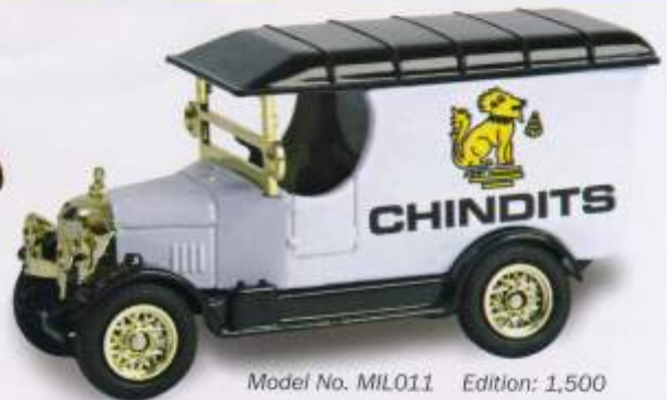
Model No. MIL011 Edition: 1,500

The name 'Chindit' came from a corruption of the Chinthe, the Burmese word for the winged stone lion - the guardians of the Buddhist temples. On its formation it was officially known as the 77th infantry and was formed and trained by Major Orde Charles Wingate DSO - "A man of genius, who might well have become a man of destiny" - Winston Churchill.