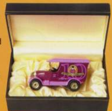
Model No. 219G Edition: 3,438