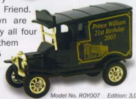
Model No. ROY007 Edition: 3,000