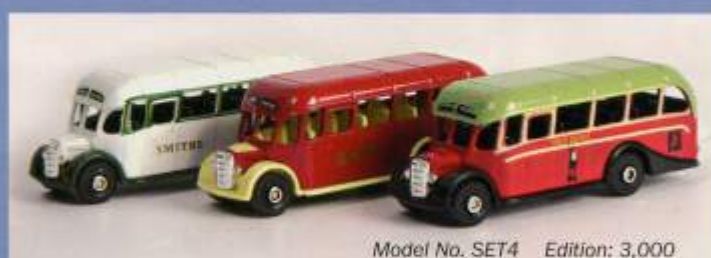
Model No. SET4 Edition: 3,000

Remember these three little beauties that we released back in 1999. The Scottish Collection. Featuring MacBrayne, Smiths and Westen. We still have some sets left which come in a mailer box and their yours for just £4.95 if you make a purchase from the Globe this month. We've only approximately 100 sets left and their available on a first come first serve basis.