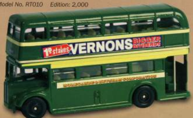
Model No. RT010 Edition: 2,000

months and are noted for their longevity.