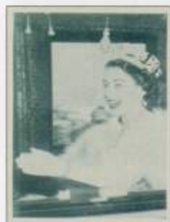
Taken in November 1952 at the state opening of parliament. Her majesty the Queen looking so happy.