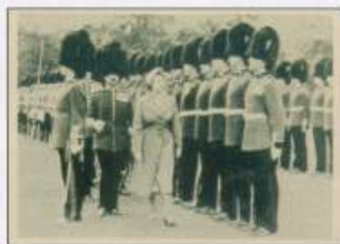
The 3rd battalion of the Grenadier Guards being inspected by the Queen - Princess Elizabeth then.

Our 48th Bullnose in the series - not long until we hit the BIG 50!