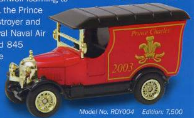
Model No. ROY004 Edition: 7,500