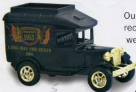
Model No. ROY006 Edition: 3,000

Our Royalty themed vehicles have been well received and such has been the success that we have had to release variations on ROY001- ROY004. They are coded as ROY005 -ROY008.