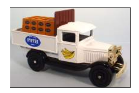
CS022 FYFFES Edition 1,500