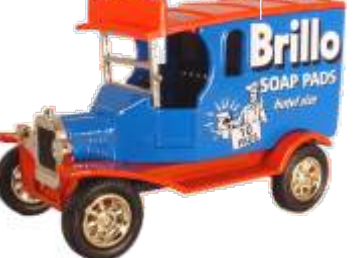
CS023 BRILLO Edition 1,500