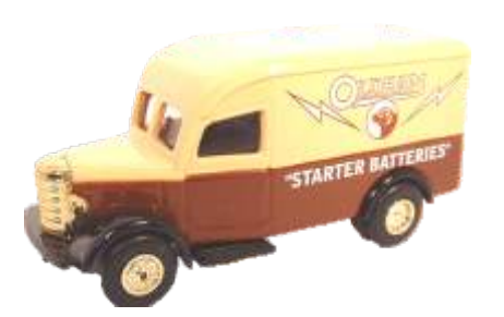
BED006 OLDHAM BATTERY Edition 1.100