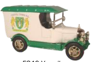
F012 Yeovil Edition 1,100