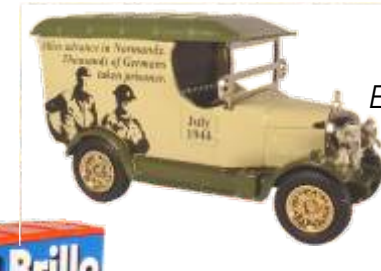
SC002 Edition 1500