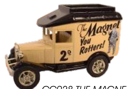
CC028 THE MAGNET Edition 1,500