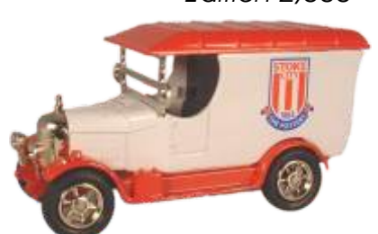
F013 Stoke Edition 1,100