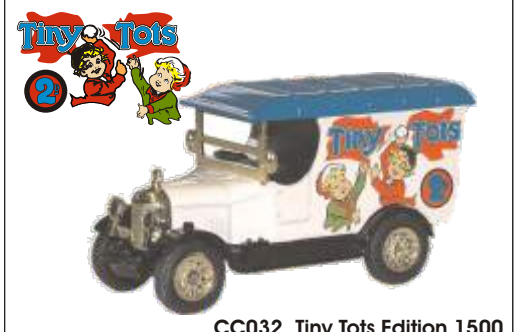
CC032 Tiny Tots Edition 1500