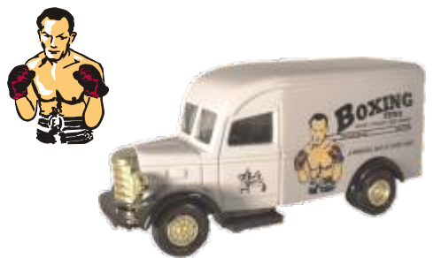
MAG015 Boxing News Edition 2,000