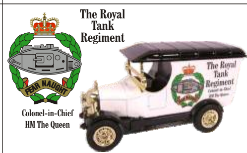
GR016 Royal Tank Edition 1,500