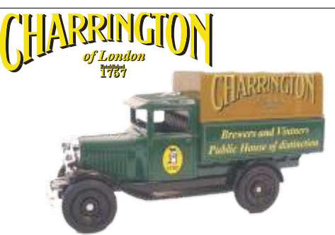
DR012 CHARRINGTONS Edition 2,000