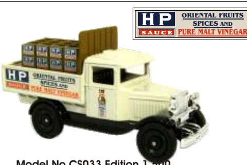
Model No C$033 Edition 1,500