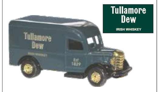
BED015 Tullamore Dew Edition 2000