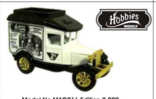
Model No MAG016 Edition 2,000