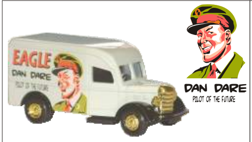
CC031 Dan Dare Edition 1,500