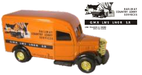
BED014 Railway Lorry Country Services Edition 2,000