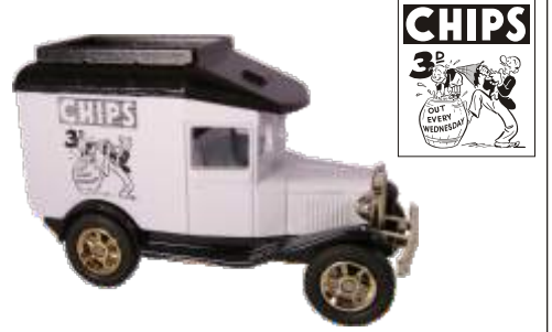
CC030 Edition 1,500