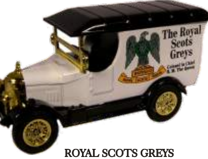
Edition 1500 Model GR018