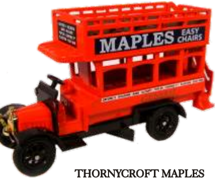
Model B081 Edition 1500