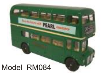
Edition 2,000 METROBUS PEARL ASSURANCE