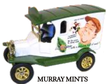
Model CS038 Edition 2,000