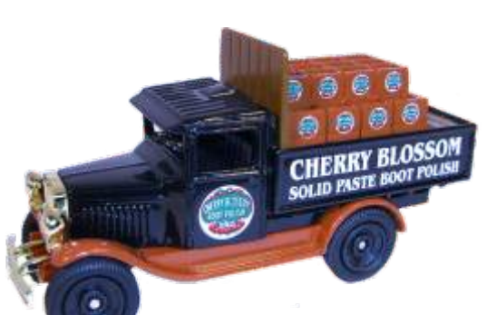
CHERRY BLOSSOM Edition 2000 Model CS039